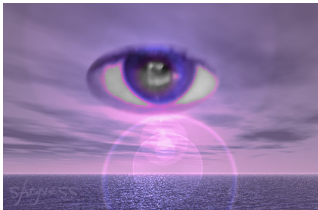
"Sadness" created by Revenant aka Slaygen

I've used this exercise to escape my body a few times. It can also induce other weird but harmless effects. Close your eyes and spend a few minutes relaxing as completely as you can and clearing your mind of all worries and idle thoughts. Then, spend a few minutes trying to decide where your consciousness is seated. Is your consciousness in the center of your head or perhaps somewhere between the eyes? Wherever it is, visualize a tiny pinpoint of light at that point. You don't have to be exact about the location. If you're not comfortable with where you have visualized the pinpoint of light, move it until you are comfortable with it. Spend a few minutes visualizing that pinpoint of light as clearly as you can. Try to shrink your awareness until you are only aware of your head. Then shrink your awareness even further, so that you can't feel anything except that pinpoint of light. Next, visualize the point of light slowly moving down toward the base of the brain, where the cerebellum is. Move it about four inches down, then slowly move it back to its original position. Repeat this visualization several times. This visualization can induce the vibrations and get you out of your body.